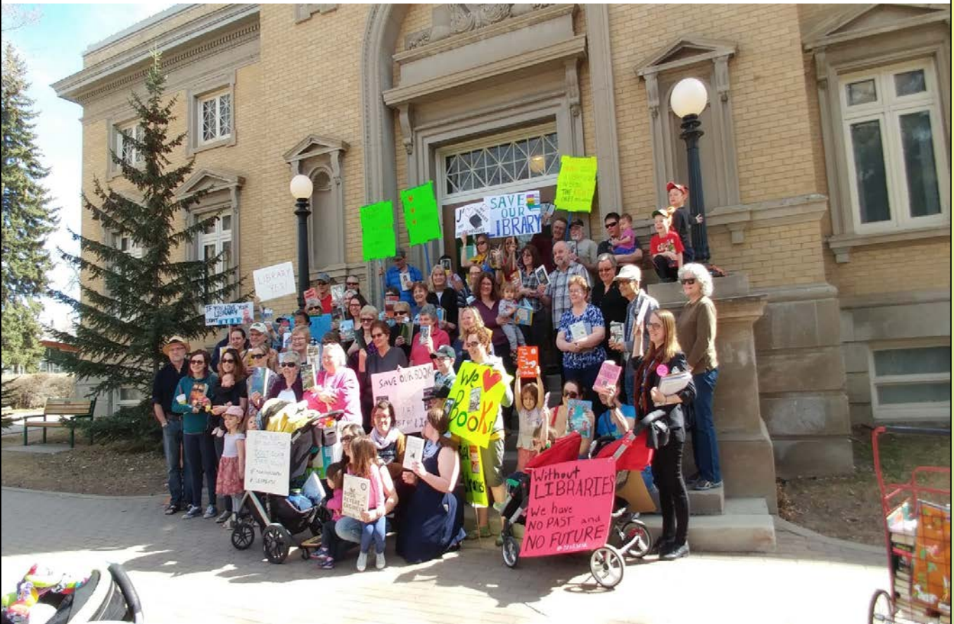
“Read- In” Supporters, April 7, 2017

Moose Jaw Mortlach Mossbank Riverhurst Rockglen Rouleau Tugaska Willow Bunch Wood Mountain