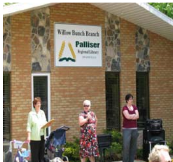
The new Willow Bunch Branch