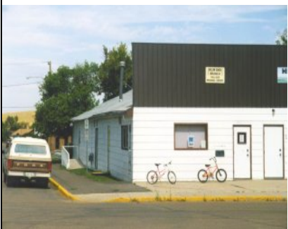
The old Willow Bunch Branch