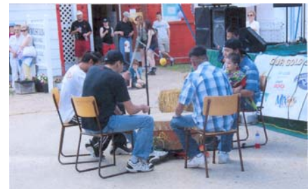
Dancers and Drummers at the Mortlach Berry Festival, July 5, 2008