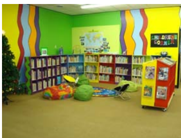
Coronach Children's Dept.