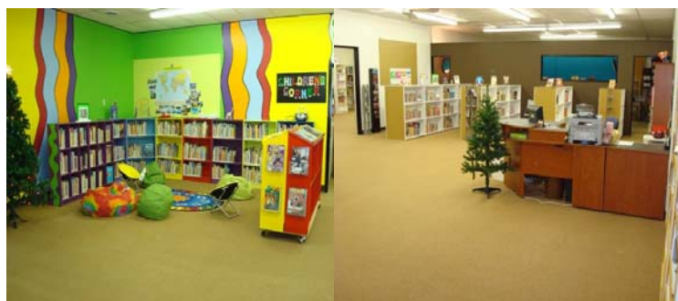
The new Coronach Branch