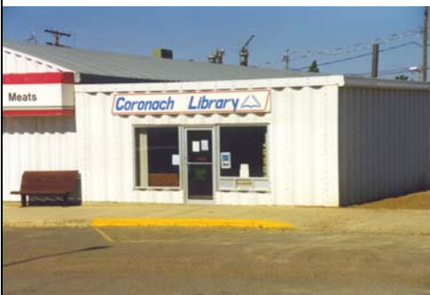
The old Coronach Branch