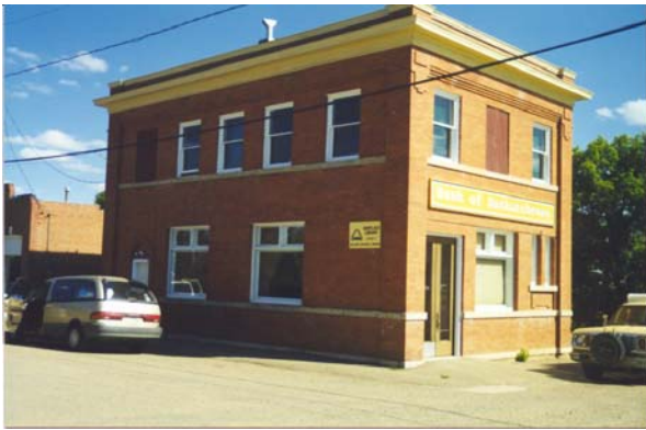
The old, now an artist's studio