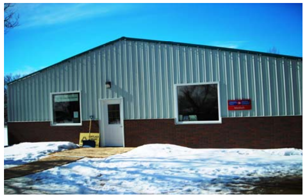
The new Community Centre